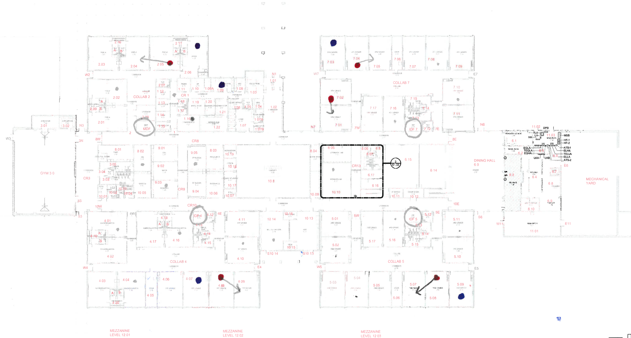
SEALY ISD SIGNAGE PLAN 2-1-18 (Final Proof) 1 ELECTRICAL COMPOSITE PLAN Scale: 1" = 20'-0"